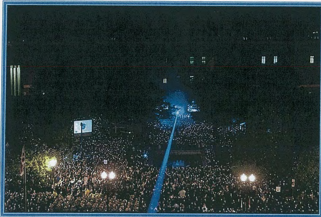
Limited overhead view of Memorial during Candle Light Vigil with app. 20,000 attendees

The 25th Annual Candlelight Vigil will be held at the National Law Enforcement Officers Memorial on Monday, 13 May 2013 in Judiciary Square*, between 4 th and 5 th Sts., NW